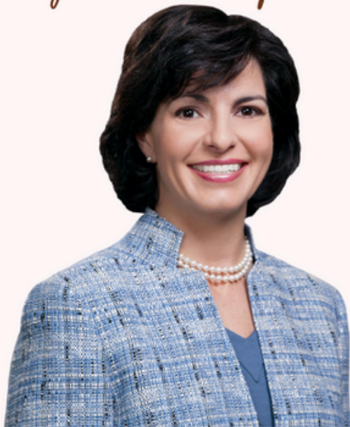
RAILROAD COMMISSIONER CHRISTI CRADDICK